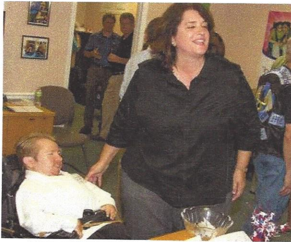
WHEELCHAIRS 4 KIDS

The Tarpon Springs-based nonprofit Wheelchairs 4 Kids held a ribbon-cutting event at its new location on S. Pinellas Avenue last month.